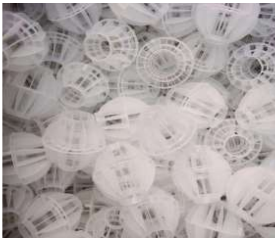
Figure 1: Physical drawing of polyhedral spherical packing.

Due to the low turbidity of the raw water, the size of the flocs formed is small, the specific gravity is close to that of water, and the movement is synchronously followed by the water flow. Without the speed difference, the flocs cannot be effectively collided, so the filler itself has multi-faceted nature and disorderly accumulation. The method can make the flocs and the water flow relatively move, and continuously change the direction of the water flow to generate a turbulent vortex, which can make the water flow resist the particles. According to the inertial effect theory [16], it is assumed that the shape of the water particles is a sphere with a radius r , the water density is the relative velocity of the particles to the water flow is F , and the hydraulic resistance of the particles is calculated as follows: