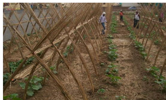
Figure: 2: Cucumber farms in the study area